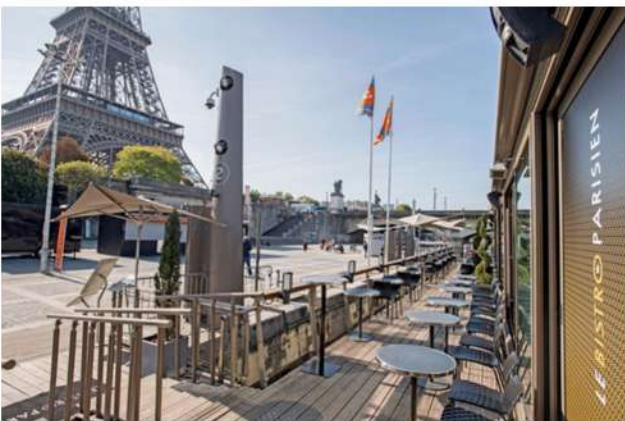
© S. d'Alloy / Le Bistro Parisien

Not far from the Eiffel Tower, the Bistro Parisien, a floating restaurant with glass windows, offers lunch or dinner with a breathtaking view of the famous monument and the banks of the Seine. You can sit out on the terrace, under the glass roof or by the water.